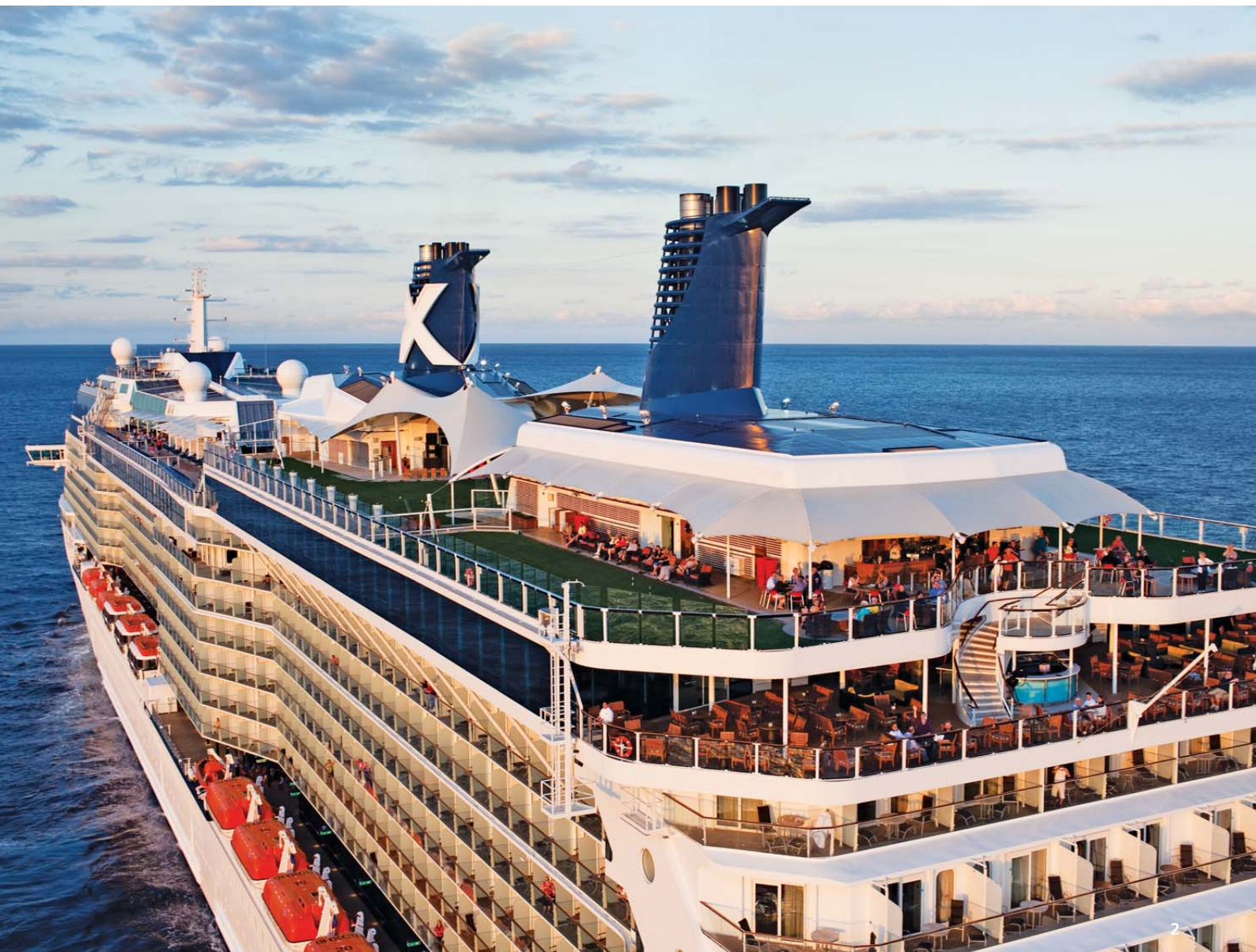
1) Martini Bar & Crush 2) Celebrity Eclipse SM 3) Enjoying a private veranda 4) The adults-only Solarium