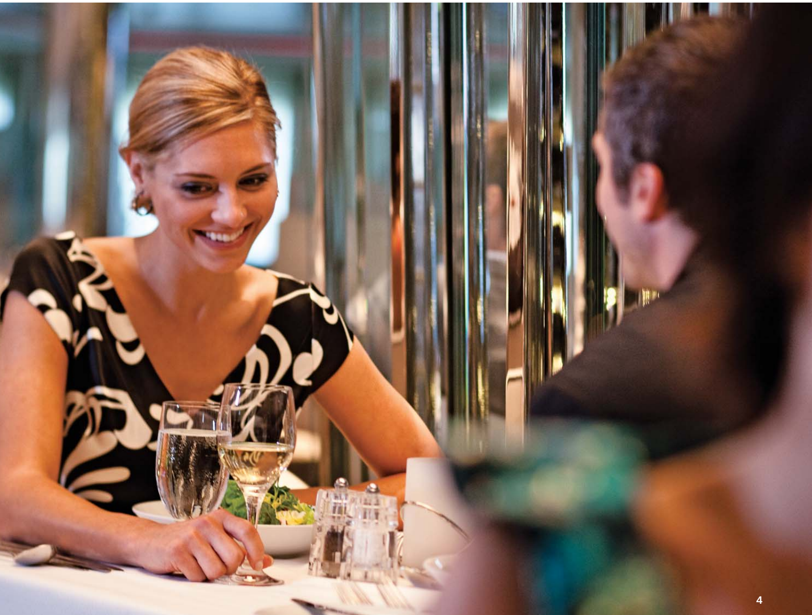
1) The artful presentation of Qsine SM 2) Personal iPad interactive menu 3) Qsine 4) Inspired dining 5) The dazzling two-story Tihany wine tower 6) Sacher Torte